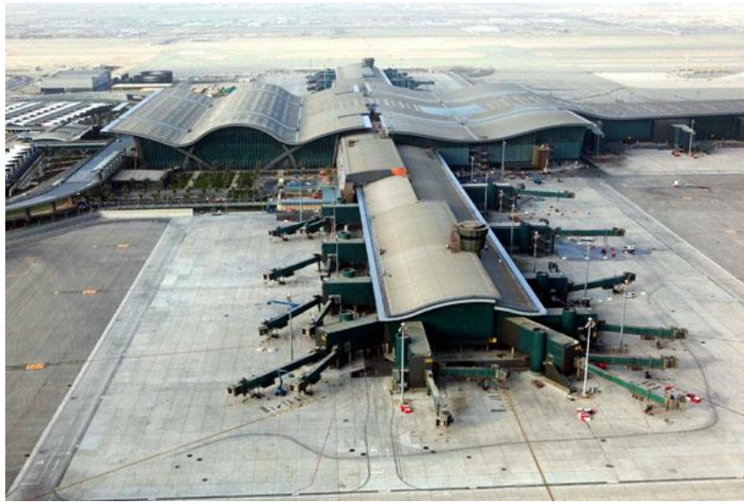
Aerial view of the Hamad International Airport