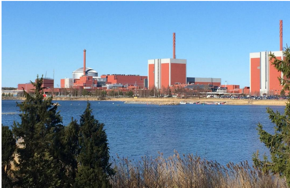
View of the Olkiluoto Nuclear Power Plant