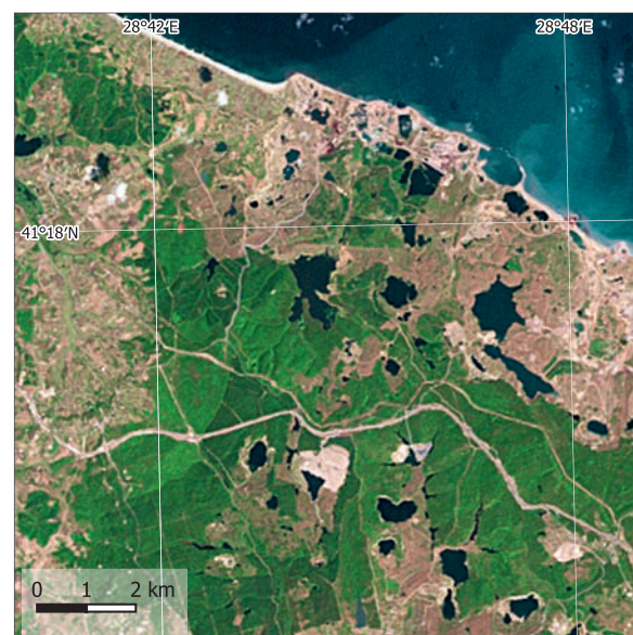
4. Region northwest of Istanbul, Türkiye. True colour satellite image showing the forests and agricultural land before the construction of the new airport. Data: Landsat 5, 2010-09-18.