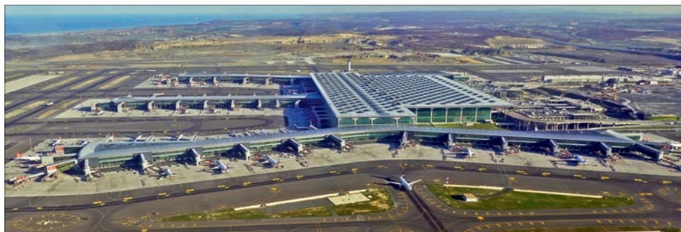
3. Aerial view of the new Airport İstanbul Havalimanı, looking West.

The satellite map shows the huge impact of the airport on the landscape. Located about 30 kilometres northwest of the city centre, the new airport has replaced forests and agricultural land on an area of almost 40 square kilometres. Additionally, the road network serving the airport was enhanced substantially.