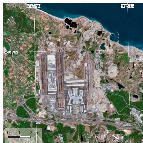
6. Istanbul Airport, Türkiye, in 2023. True colour satellite image map, data: Sentinel-2, 2023-07-23.