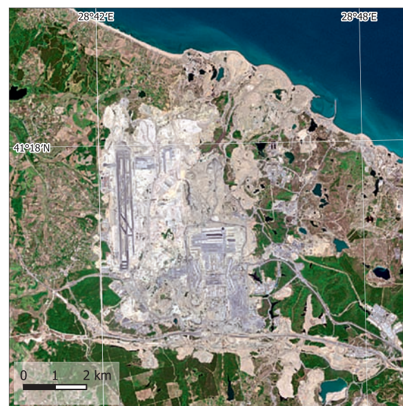
5. Construction site of the new Istanbul Airport in 2017. True colour satellite image highlighting the extent of the construction work. Data: Sentinel-2, 2017-07-24.